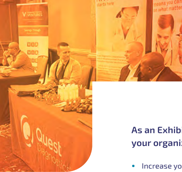
Exhibit with IPHCA