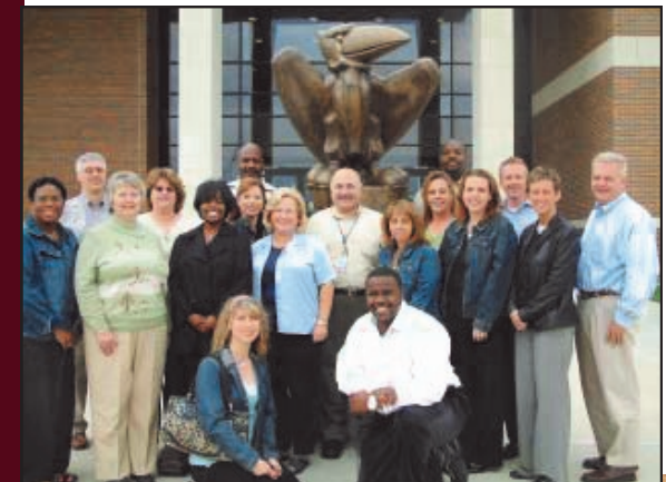
Pictured above: The 2007-08 Fellowship class

In collaboration with Greater Midwest Association of Primary Health Care